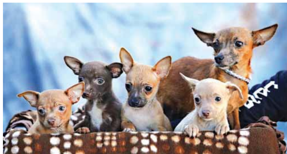
Racine and her 10 nweek old puppies.

them in his family. Gentle, loving, sweet, calm, mellow and easygoing, Connor is fabulous in every way. He was raised as an inside dog, is totally housebroken and has very good house manners. Connor walks superbly on leash and just loves to be with you wherever you are, no matter what you are doing. He would be best placed as an only dog or with another large female dog--he is not cat-safe. Remember that at 125 pounds, Connor can eat fair amount of dog food, so keep this in mind when budgeting for a new family member. Connor is neutered, current on vaccinations, has had a dental, is de-wormed, microchipped